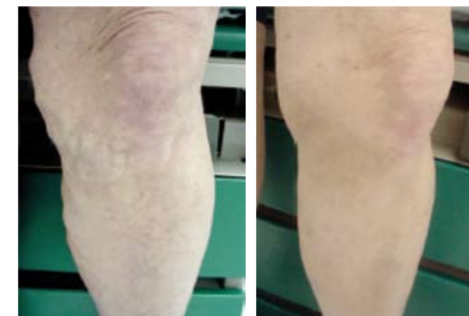
Before Endovenous Laser Treatment After Endovenous Laser Treatment

Immediate walking is encouraged to promote healing. Little to no pain is typically experienced, but may be treated with over-the-counter pain relievers as needed.