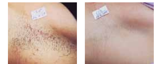
Before Post treatment