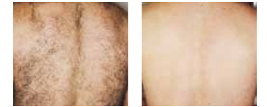
Before Post treatment