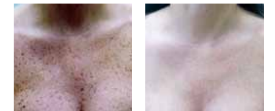
Before Post treatment